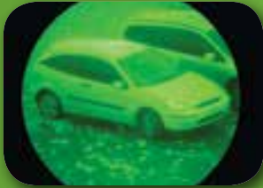
KITE IN LINE night vision