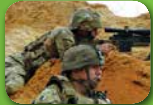
KITE IN LINE