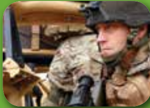
KITE IN LINE